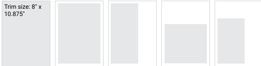
Full Page (bleed) 8.25" x 11.125" Full Page (no bleed) 7" x 10" 2/3 Page Vertical 4.5" x 10" 2/3 Page Horizontal 7" x 6.5" Half Page Island 4.5" x 7.5"

All dimensions shown are width x height. For bleed ads, keep type .25" away from trim size.